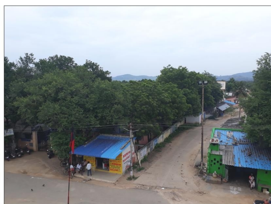
Initial Project area : Karnampet Village

Overall goal of the Trust is to promote holistic development of the people incorporating the dimensions of education, health, welfare, economic development, ecology, family, society and sustainable livelihood/development.